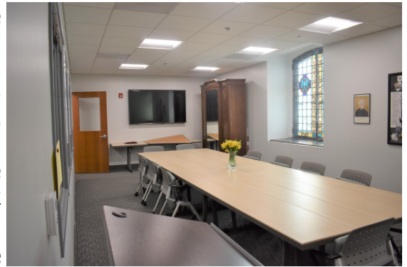
New Meeting Room at FMC

On February 13, at our Grand Re-Opening I had the pleasure to thank hundreds of people who made the successful renovation of the lower level of St. Aloysius Church possible. From the donors whose generosity allowed us to make these renovations, to the architects and contractors who remade this building into a really amazing space for the people we serve. I also got to thank our amazing team here at The Father McKenna Center for their willingness to work through the noise and the dust of the renovations!